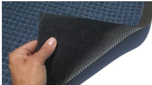
Nitrile Rubber Backing with Grip Nobs