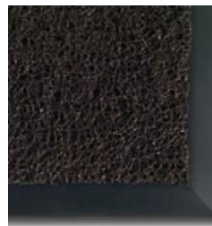
Medium Profile Vinyl Edging Available