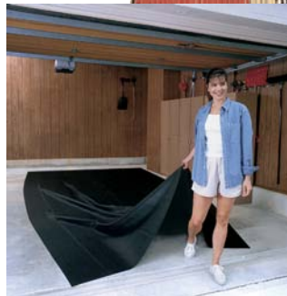
Easy to Maintain and Clean

9' widths by custom lengths up to 100 lineal feet in 1" increments.