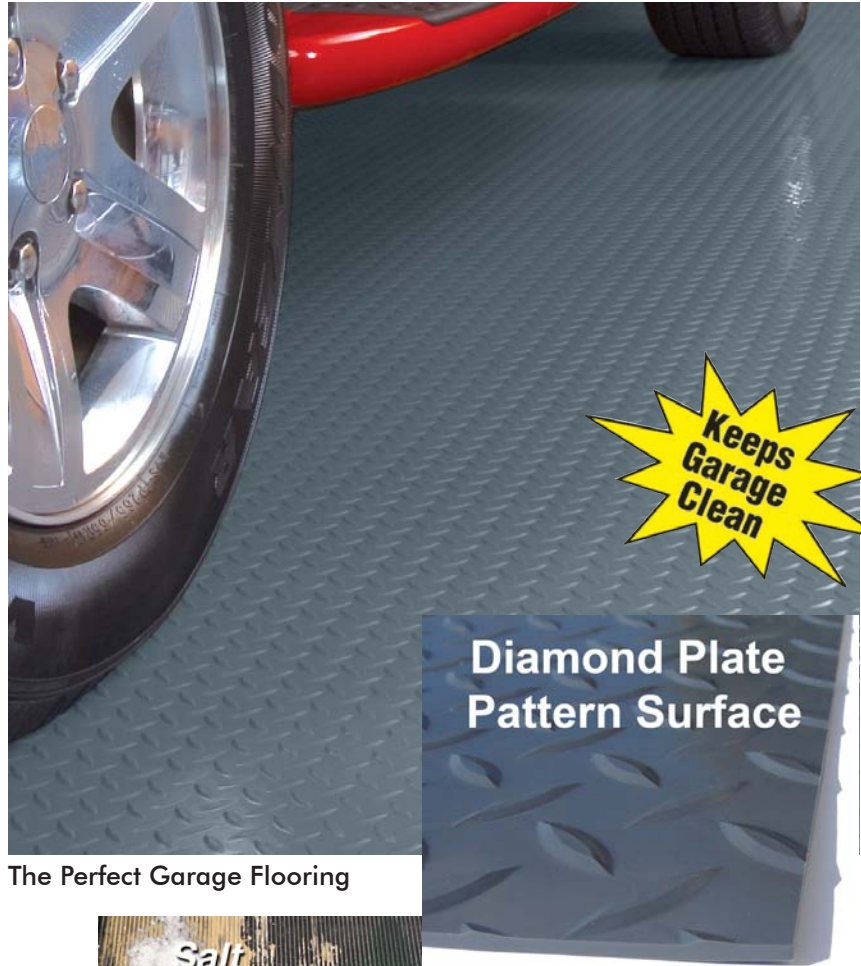
The Perfect Garage Flooring