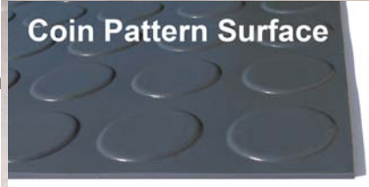
Easy to Install and Seam