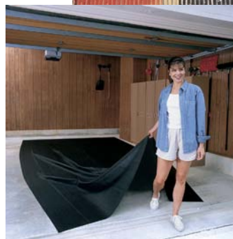
Easy to Maintain and Clean