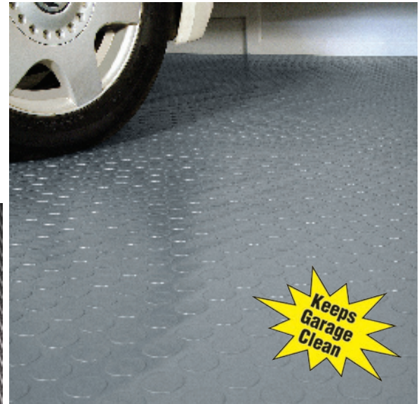
The Perfect Garage Flooring