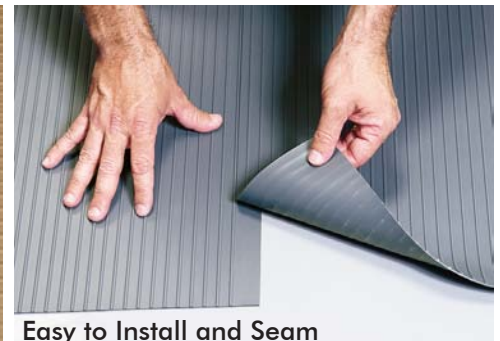
Easy to Install and Seam