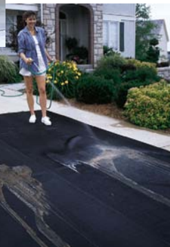
Easy to Maintain and Clean