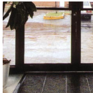
Super Tile in Entrance