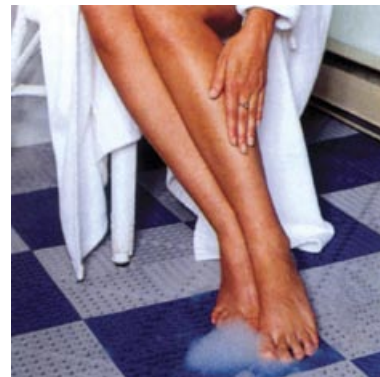
Super Tile in Wet Areas