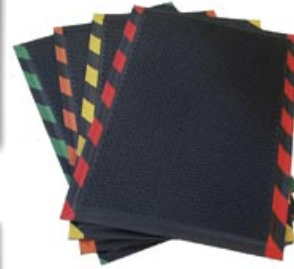
Available w/ OSHA Approved Colored Borders