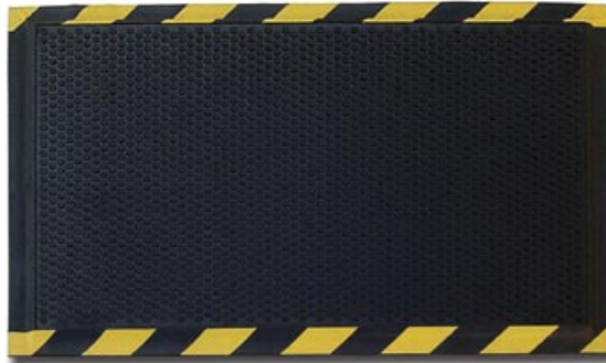
Grip Top w/ Yellow Border