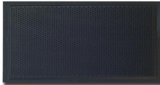
Soft Step w/ Grip Top