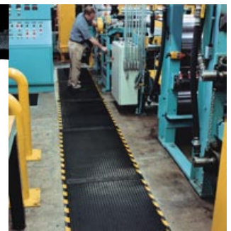
Linkable for Long Runners