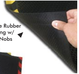
Nitrile Rubber Backing w/ Grip Nobs