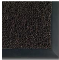
Medium Profile Vinyl Edging Available