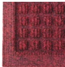
Fashion Fabric Edging