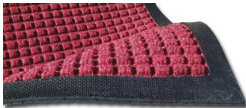
Rubber Edging Holds Water In