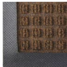
Black Rubber Edging (standard)